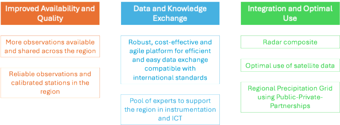
Figure 1 - Framework of the Regional Observations Strategy 2025-2030.

The overarching framework of this strategy consists of three main Pillars: Improved Availability and Quality, Data and Knowledge Exchange, and Integration and Optimal Use. This strategy establishes ten ambitious goals under these pillars (see Figure 1 ) aimed at enhancing observation and monitoring capabilities.